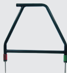
vLoc3 Accessory A-Frame