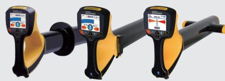
vLoc2 receiver series