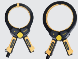
4" and 5" Signal Clamp