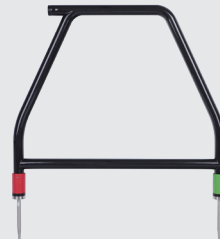
vLoc3 Accessory A-Frame