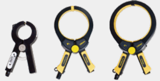
2", 4", and 5" Induction Clamps