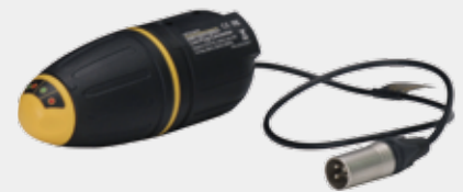
LPC Separation Filter